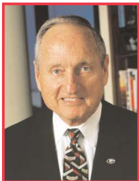
Mr. Vince Dooley University of Georgia Director of Athletics, 1979-2004 Head Football Coach, 1963-1988 “Leading in Tough Times”

There may be no more decorated director of athletics and former head coaches in the country than Georgia’s Vince Dooley who served as head football coach at UGA from December, 1963, to Jan. 1, 1988, and as Director of Athletics from 1979-2004. He has been a man of great foresight in times of charting the future, stability in times of change, and vision in critical times that shaped the path of college athletics.